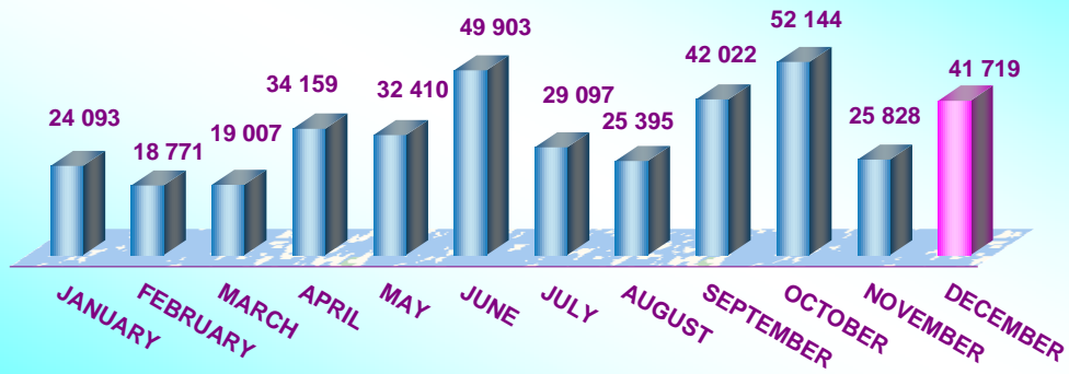
Total of treated securities at STICODEVAM from January to December 2009